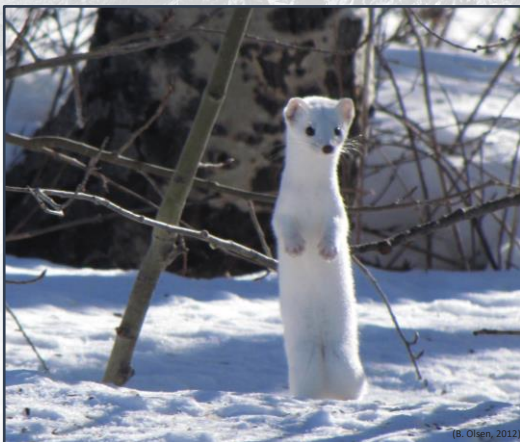
(B. Olsen, 2012)