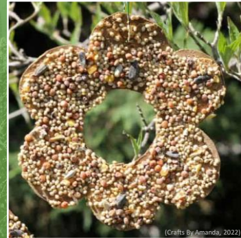
(Crafts By Amanda, 2022)